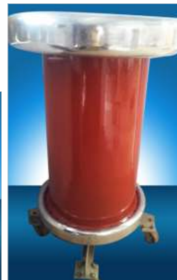
Power Frequency Test Up to 200 KVrms.