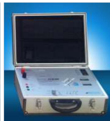
Contact Resistance Measurement Kit in Micro Ohms.