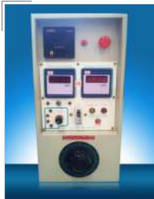
Insulation Break Down Test - 5 KV.