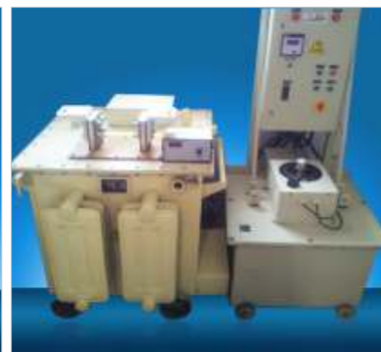
Current Injector for Heat Run Test Up to 2500 Amp.